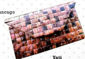
Yati Design By Salam Rancage