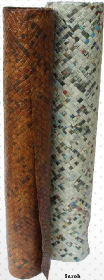
Saroh (28x28x7) Design By Salam Rancage