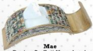
Mae Design By Fuji Nurrohmah in collaboration with