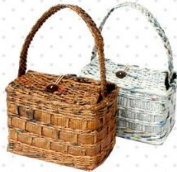
Enik (8x5x11) Design By Salam Rancage