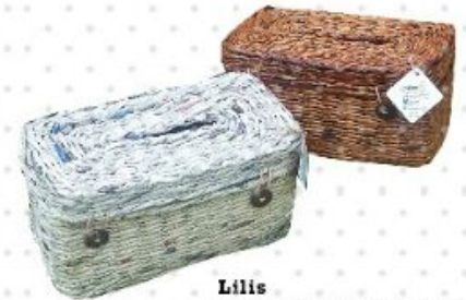
Lilis Design By Salam Rancage