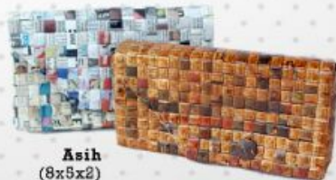
Anih (8x5x2) Design By Salam Rancage