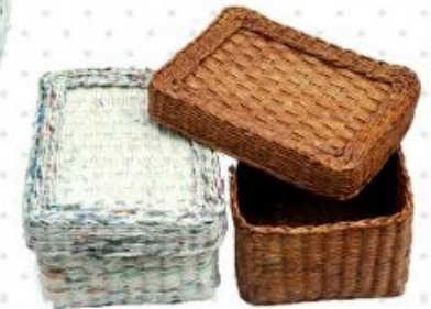
Dastem (14.5x11x8) Design By Salam Rancage