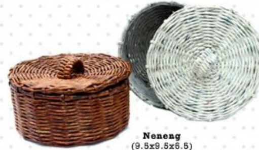
Neneng (9.5x9.5x6.5) Design By Salam Rancage