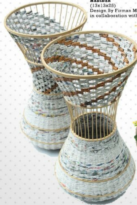
Habibah (13x13x26) Design By Firman Mutaqin in collaboration with