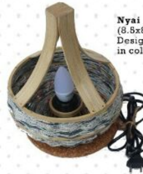
Nyai (8.8x8.8x11) Design By Handoko Dwi P. in collaboration with