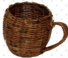
Otih (7.5x5.5x5.5) Design By Salam Rancage