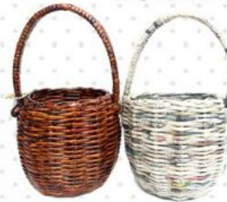
Titin (8x6x10) Design By Salam Rancage