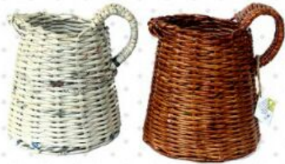
Teko Anih (7x7x8.5) Design By Salam Rancage