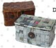
Atun (6.5x6x5x13.5) Design By Wiedya Nadya P. in collaboration with