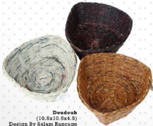
Deudeuh (10.5x10.5x4.5) Design By Salam Rancage