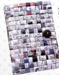
Aniek Design By Salam Rancage