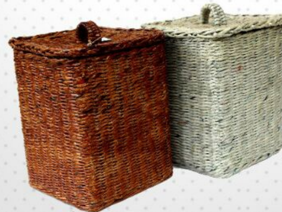
Ira (10x9.5x14) Design By Salam Rancage